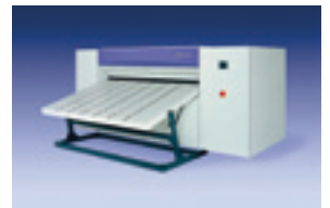
Above: PlateRite Ultima 24000.