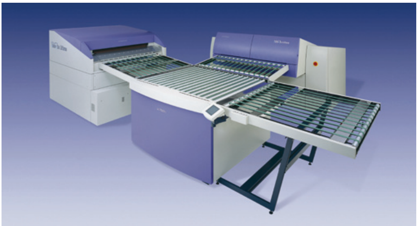
PlateRite Ultima 16000II with autoloader.

Not only can the advanced PlateRite Ultima large-format platesetters load a single large-size plate onto the drum, they can also load pairs of smaller plates together. Imaging pairs of plates increases productivity as plates need to be loaded and unloaded fewer times. The PlateRite Ultima 36000 and 24000 ZX and Z series models also feature twin imaging heads that enable simultaneous imaging of two plates, for even higher production.