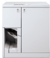
Xerox Tape Binder