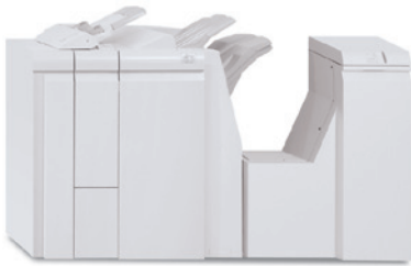
Standard Finisher Plus. With Optional C-Z Folder plus DFA (Document Finishing Architecture) required to support additional finishing options