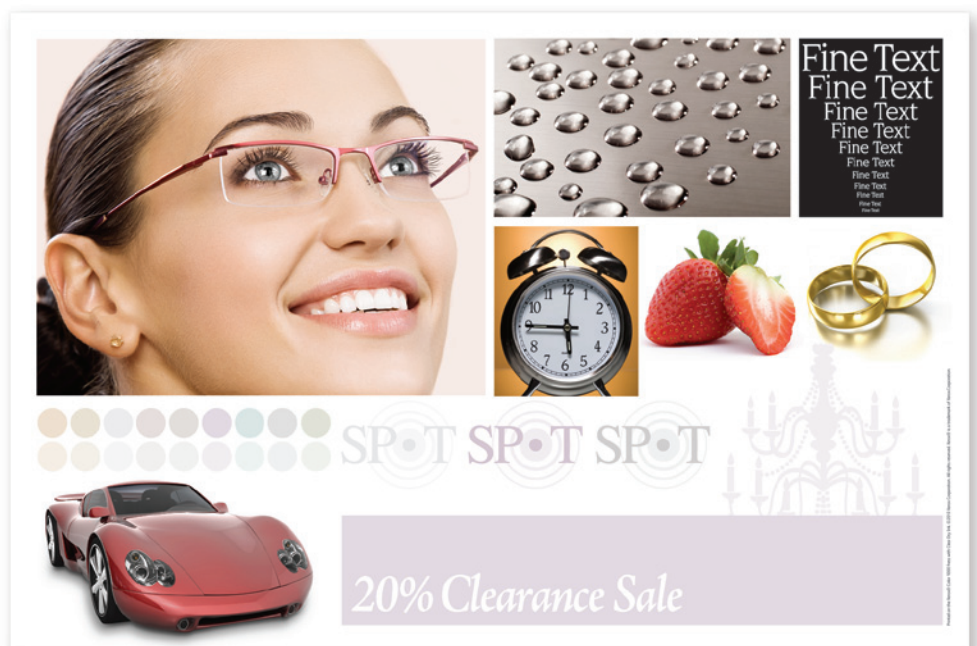
Base image without clear dry ink areas.

The creative options you can offer by adding this new, clear dry ink capability can help you become a true partner to your customers. You can advise customers already expert in design and layout on how to set up their files properly for this additional clear layer to achieve their desired effect. Or you can offer creative value to customers when they deliver their files, by adding some of these effects right at your print server.