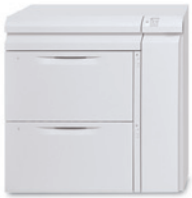
Optional High Capacity Feeder