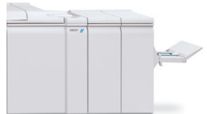
PlockMatic Pro 30 Booklet Maker