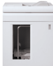
High Capacity Stacker (Single or Dual) up to 5,000 Sheet Removable Cart (Top Tray 500 Sheets)