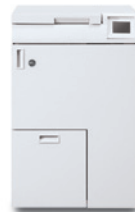
GBC® eBinder 200™