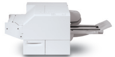
Xerox® SquareFold® Trimmer Attaches to the optional Booklet Maker Finisher

From high capacity stacking, hole punching and folding to square fold booklets and layflats, our array of finishing options add polish to all your applications.