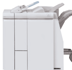
Booklet Maker Finisher with Optional C-Z Folder (25 sheets or 100 page booklets)